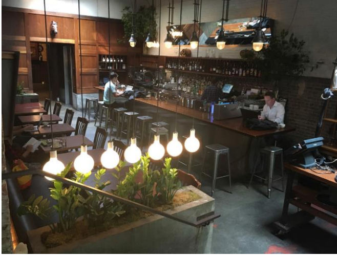
Spacious, NY coworking

For instance, in NYC was clear that the interest in coworking spaces is growing constantly, at a global level and especially in big cities with highly inflated rents. The innovation cases lay mainly on the space optimization and the different uses of the same space giving a series of connection between café and workplaces.